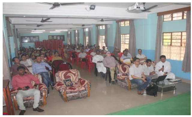
•3<sup>rd</sup> April 2023: The Department of Economics organized a seminar for the honours students of the department on 3<sup>rd</sup> April 2023 in Bosco Hall