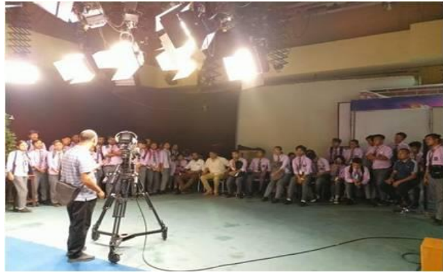
•3<sup>rd</sup> of May 2023: In the series of various academic activities, the sociology department organized a departmental seminar for the 6th semester sociology honours students on the 3<sup>rd</sup> of May 2023 at Bosco Hall.