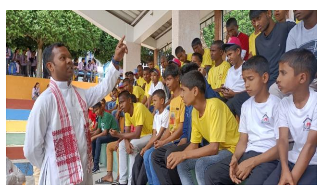
•2nd May, 2023: Physics Students Visit DDK, Nokpante Studio as part of their study on 2nd May, 2023.