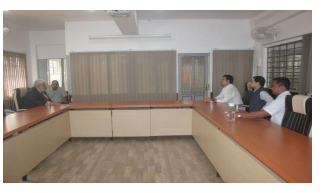
13<sup>th</sup> to 17<sup>th</sup> June 2023: Seventeen enthusiastic volunteers from Don Bosoc College, Tura recently embarked on a transformative journey to attend the NorthEast NSS Festival held at Pachhunga University College in Aizawl, Mizoram. The five-day event, provided the students with invaluable learning opportunities and unforgettable experiences.