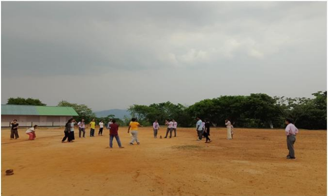
•May 13, 2023: The first batch of students from the Certificate Course in A·chik Folk Arts (CAFA) received their certificates in a ceremony held on May 13, 2023.