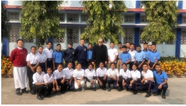
•on 19 January 2023: The students of BA Economics Semesters 3 and 5 (Shift I) went on a study tour to Nokrek National Park to study about the ecological and economic significance of the region.