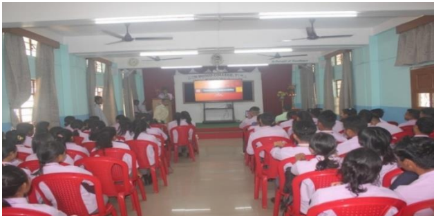
•16<sup>th</sup> March 2023: Online Career Guidance Programme for the Final Semester Students on the theme "Reinvent & Reinvest in Life" by reinventmyskill.com was held at 12:00 Noon in the Bosco Hall.